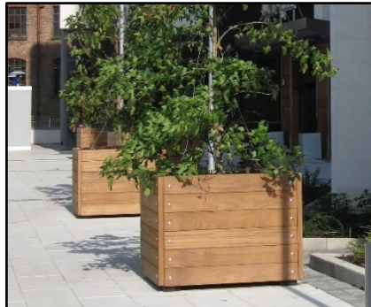
Visual illustration of what removable planter boxes will look like

The subject property is listed on the Shires Municipal Inventory, being located within the Winfield Street Precinct ( Attachment 3 ). The proposed artwork is not considered to negatively impact the street precinct and the subject building whilst in the Heritage Precinct is not especially old or and the walls to be painted do not represent unique design or great heritage value.