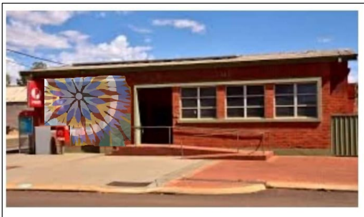
Winfield Street Design

The artwork is proposed to commence in May 2022. The intended artwork will be colourful, contemporary art in dot formation showcasing flora and fauna. With background red brick being incorporated into the proposed design.