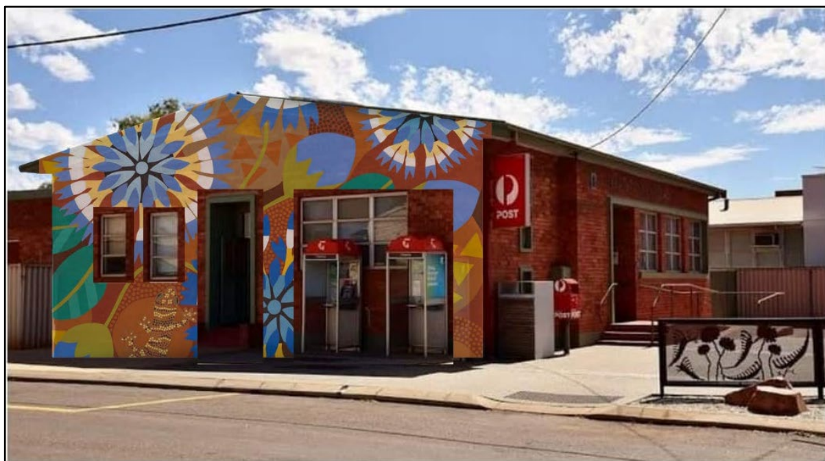
Prater Street Design