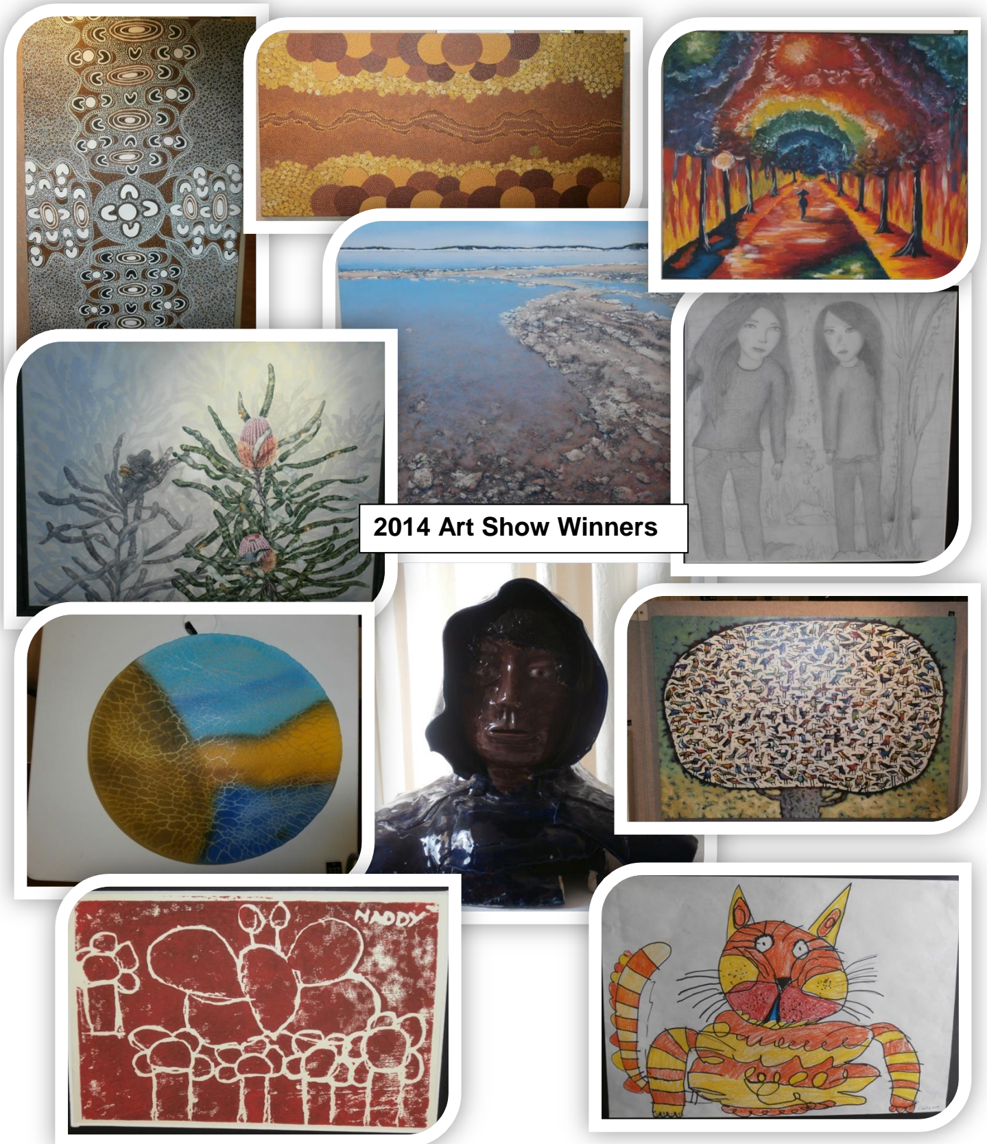
2014 Art Show Winners