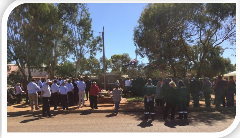
AUSTRALIA DAY 2015