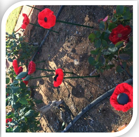
ANZAC DAY 2015