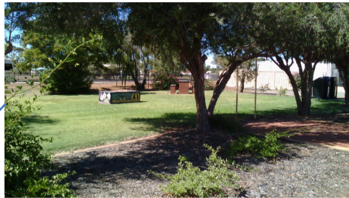
Alternative Proposed Site for some of the play equipment