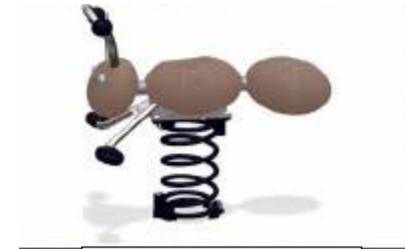
Forest Ant Springer