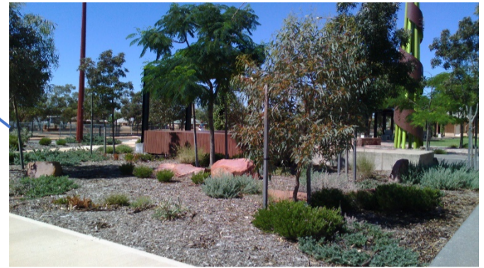
Original proposed site for play equipment